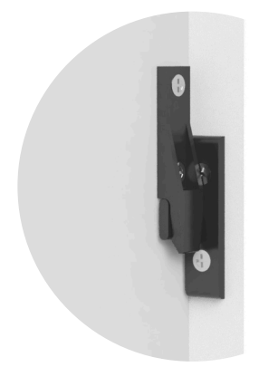
“Keku” Hook Clip