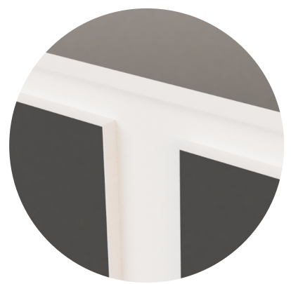
Matching colour or choice of PVC Edge